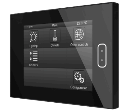
Z40 The 4.1" color touch screen blends in any environment, especially in those with Italian, American, or Australian push buttons, thanks to its possibility of installation both horizontally and vertically. A real powerhouse that adapts to any environment.