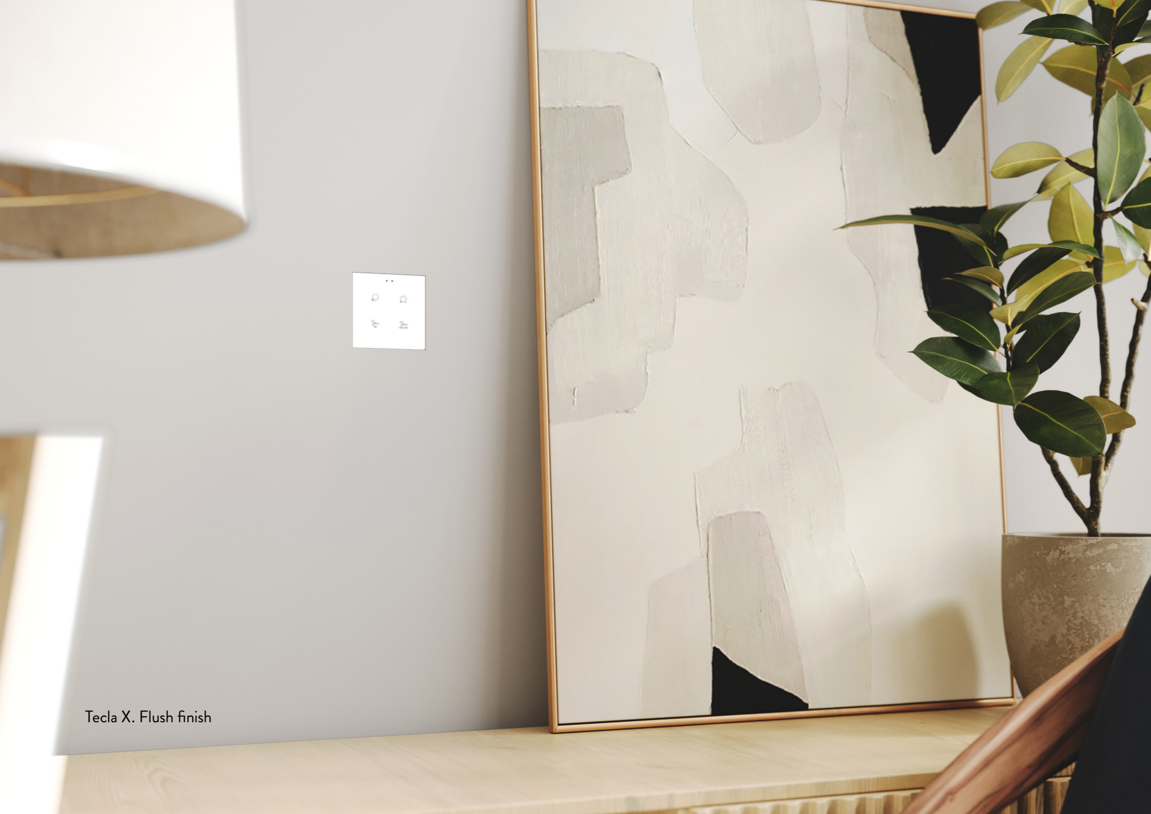
Tecla X. Flush finish