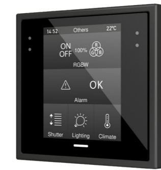
Z28 2.8" color touch screen. Its installation in 70x70 frames makes it a compact, discreet solution with a multitude of possibilities. Z28 allows installation in double frames of LS Jung or Zennio ZS70. Beauty and discretion.