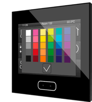
Z35 3.5" color touch screen in a square format. Z35 has proven to be the best complement for any room, it's that screen that always sets the bar high. At the head of the bed, at the entrance of the room, as a thermostat in hotel rooms: wherever it is, Z35 is a good choice.